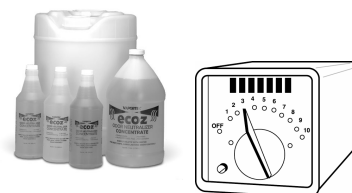
Optimum 4000 & Ecos